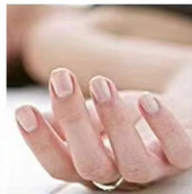
Cure Ringworm of The Nails