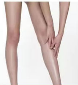
Blood Vein Removal